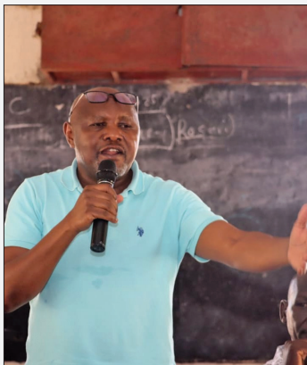
Mwingi North MP Hon. Paul Nzengu when he chaired the public participation meeting in Turkana County

Across all regions, the Committee encouraged submission of additional views and written memoranda within seven days through the Office of the Clerk of the National Assembly. Committee leaders assured residents that all contributions would be considered in the final report to be tabled before the National Assembly.