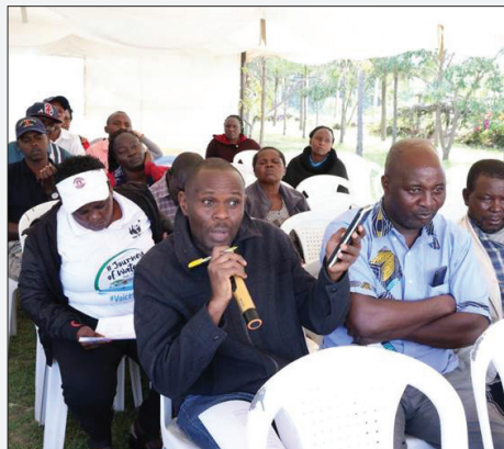
A local resident sharing his views of the Bill in Naivasha