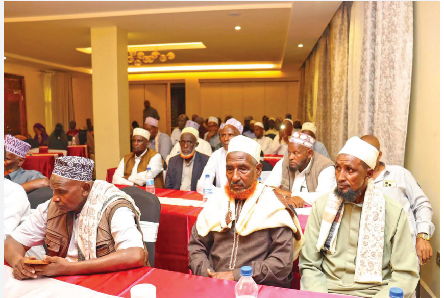
Residence of Moyale following through the session