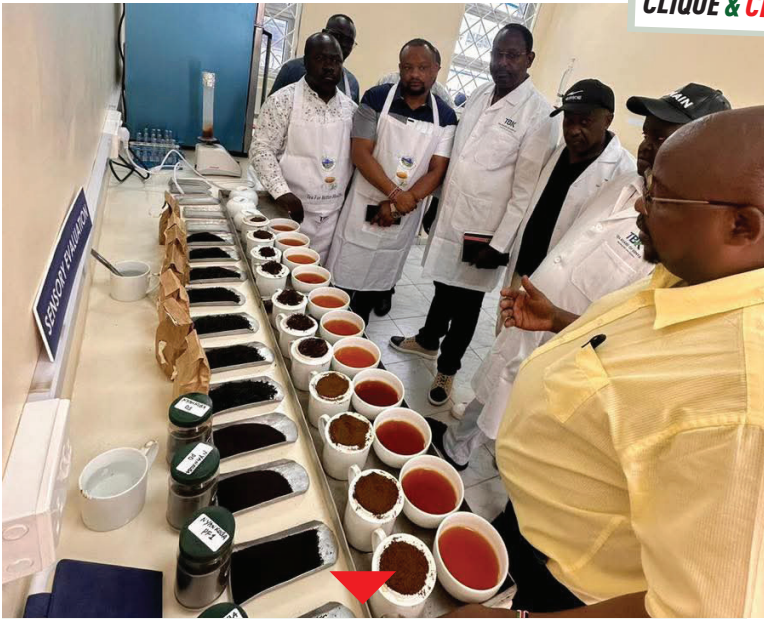
Members of the Agriculture and Livestock Committee get taken through the tea testing process at the Tea Board of Kenya Mombasa. This was during their inquiry into tea pricing