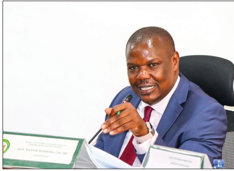
Hon. Wanami Wamboka, Chairperson of the Public Investments Committee on Governance and Education, during the meeting cautions Institution Heads on financial mismanagement in institutions of Higher Learning

Kiambu National Polytechnic also appeared before the Committee, with Members reviewing the handling of KES. 2.8 million held in an account for a prolonged period. The Ministry of Education is required to respond on the utilization of the funds. Legislators