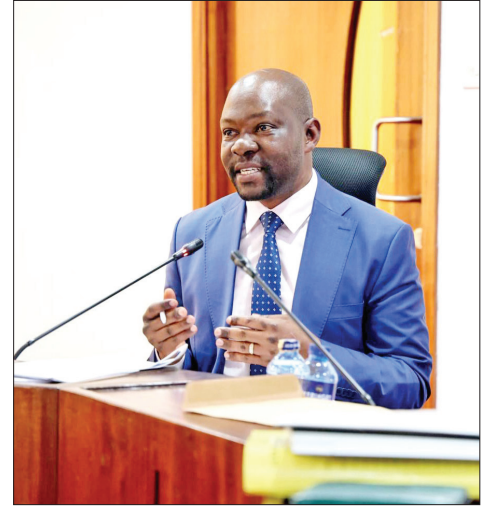
The Vice-chairperson of the PIC-SSAA hon. Caleb Amisi, chairing a meeting with the management of the KMTc on audit queries at Bunge Tower, Parliament Buildings

To address the crisis, KMTc has increased its sponsor contribution rate from 20% to 27.6% beginning July 2024 and committed to injecting KES. 100 million annually. The Committee said it would invite the Retirement Benefits Authority and the National