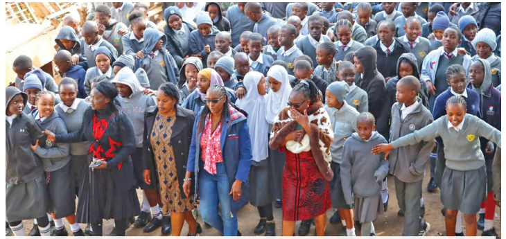
Dagoreti North MP Hon Beatrice Elachi (centre in a blue jeans) welcomed by teachers and students of Kawangware primary school during the unveiling of modern classrooms.

The Dagoreti North NG-CDF under the patronage of area MP Hon Beatrice Elachi is undertaking an infrastructure programme in public schools aimed at giving the institutions a facelift and boost enrolment.