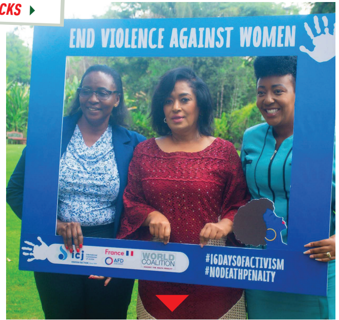
From left: The vice chairperson of KEWOPA Hon. Beatrice Elachi, MP Dagoretti North and the County MP, Nairobi Hon. Esther Passaris joined by Nominated Senator Hon. Tabitha Mutinda holding a selfie photo board after a meeting on 16 days of activism against Gender Based Violence (GBV) at a Nairobi Hotel