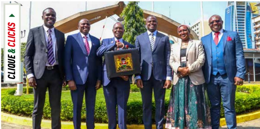
Prof. Njuguna Ndung'u (holding the budget briefcase) pose for a photo with Leader of the Majority Party, Hon. Kimani Ichungw'ah (second left), Deputy Leader of the Majority Party, Hon. Owen Baya (far right), Majority Whip Hon. Silvanus Osoro (far left) and Deputy Majority Whip, Hon. Naomi Wago (second right) when he arrived to present the budget highlights on Thursday, June 13, 2024