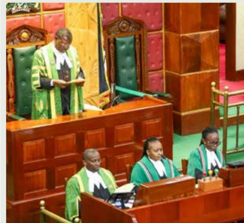
Speaker of the National Assembly, Rt. Hon. (Dr.) Moses Wetang'ula presiding over the House sitting on Thursday, June 13, 2024

S peaker of the National Assembly, Rt. Hon. (Dr.) Moses Wetang'ula on Thursday, June 13, 2024 told the House that he will give direction on request for statements on the ban on the sale and use of Muguka in the coastal region.