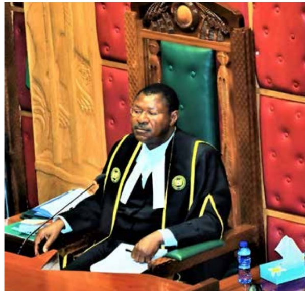
Speaker of the National Assembly, Rt. Hon. (Dr.) Moses Wetang'ula presiding of a past sitting of the House

In addition, Section 36 of the Public Audit Act, 2015 requires the