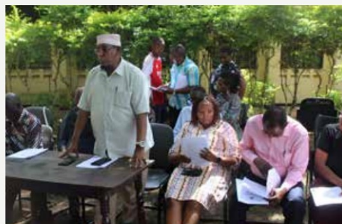
Chairperson, Committee on National Cohesion and Equal Opportunities, Hon. Adan Haji addressing members of the public at Matuga NG-CDF offices during a public participation exercise on the National Cohesion and Integration Bill

The Committee held similar public engagements in Nyali Constituency, Mombasa County and Matuga Constituency in Kwale County.