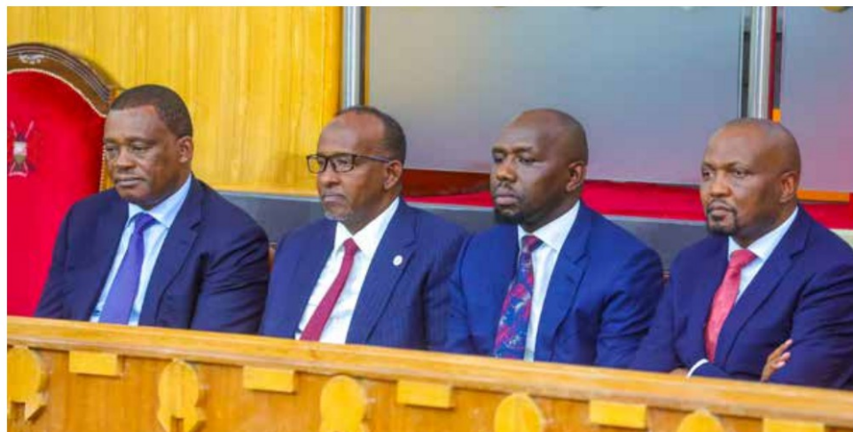
From left: Attorney General, Hon. Justin Muri, Cabinet Secretary for Defence, Hon. Aden Duale, Cabinet Secretary for Roads and Transport, Hon. Kipchumba Murkomen and Cabinet Secretary for Public Service, Performance and Delivery Management, Hon. Moses Kuria, following presentation of Budget highlights for FY 2024/2025