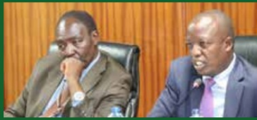
COMMITTEES' ROUND-UP Committee on Education questions implementation.... ▶ PAGE 5