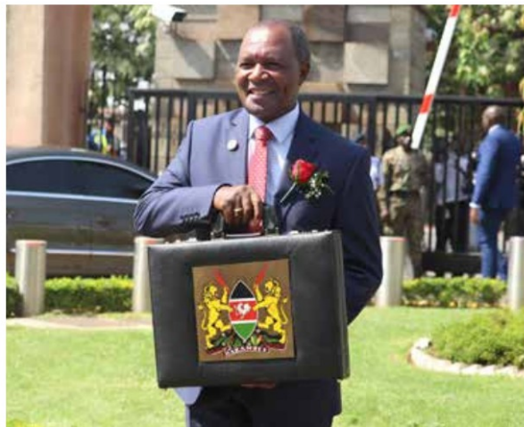
Cabinet Secretary, National Treasury and Economic Planning, Prof. Njuguna Ndung'u pose for a photo while holding the budget briefcase on arrival at Parliament Buildings