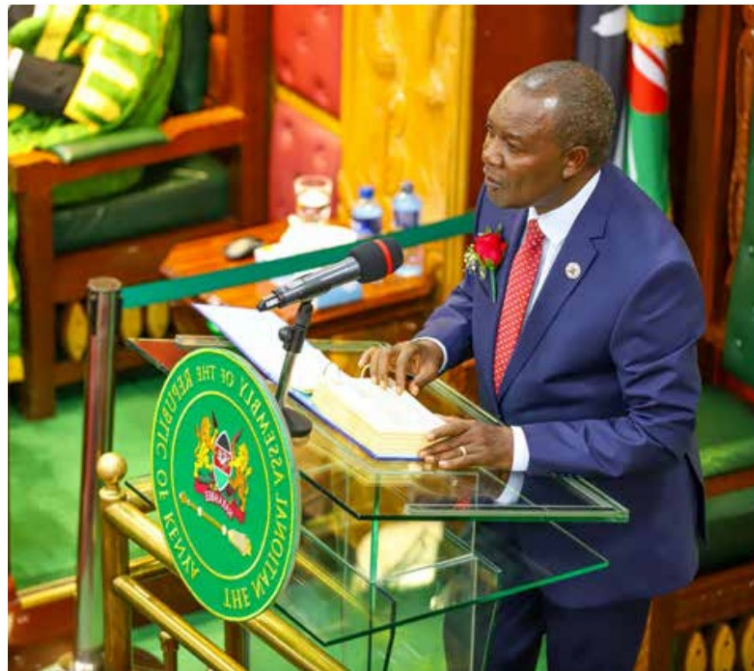
Cabinet Secretary, National Treasury and Economic Planning, Prof. Njuguna Ndung'u, presenting the Budget Highlights to the National Assembly on Thursday June 13, 2024

On revenue projections for the FY 2024/2025, Prof. Ndung'u placed an estimate of Kshs.3.343 trillion, including Appropriation-in-Aid (A-in-A), which is equivalent to 18.5 percent of the Gross Domestic Product (GDP). The total Government expenditure for the 2024-2025 financial