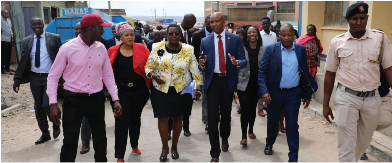
Members of the Senate Committee on Devolution and Intergovernmental Relations led by Senator Peris Tobiko tour the Kajiado Municipality Market last week.

Senate Committee on Devolution and Intergovernmental Relations led by Senator Peris Tobiko toured Kajiado County, to inspect Kajiado Municipality Market following a petition to the Senate by Kajiado Municipality Market Traders.