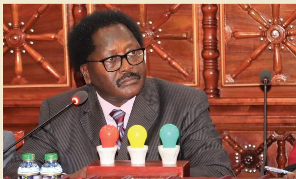
Committee Chair Senator Julius Murgor

The Chairperson of the Senate Standing Committee on Labour and Social Welfare presented a report to the Senate on the status of legislative business that is currently under consideration by the Standing Committee on Labour and Social Welfare.