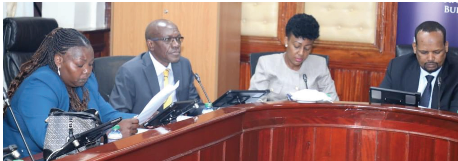
A session of the Senate Standing Committee on Finance and Budget presided over by Manderu Senator, Ali Roba (Right).

The monthly disbursement to counties is set at an average of 8 percent of the total