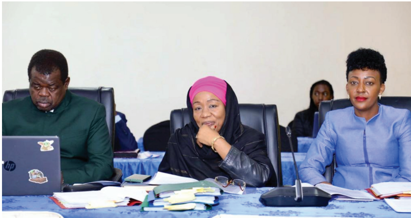
Members of the Senate Committee on County Public Investments and Special Funds during a session last week with Busia County Governor Paul Otuoma.

"You must take a hands-on approach in steering the Company," Senator