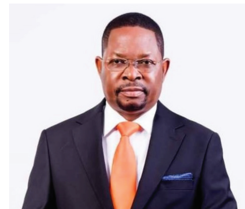
Kilifi Senator and Senate Minority Leader Stewart Madzayo

The committee is required to respond to the Petitioner by way of a Report addressed