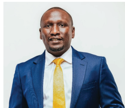
Kericho Senator and Senate Majority Leader Aaron Cheruiyot

They also want the Senate to initiate inclusion of all schools in Malindi Municipality including Sabaki primary school, Sabaki secondary school, Majivuni primary school and Kibokoni primary school for teachers to receive enhanced house allowance under category 2 as per the Salaries and Remuneration Commission