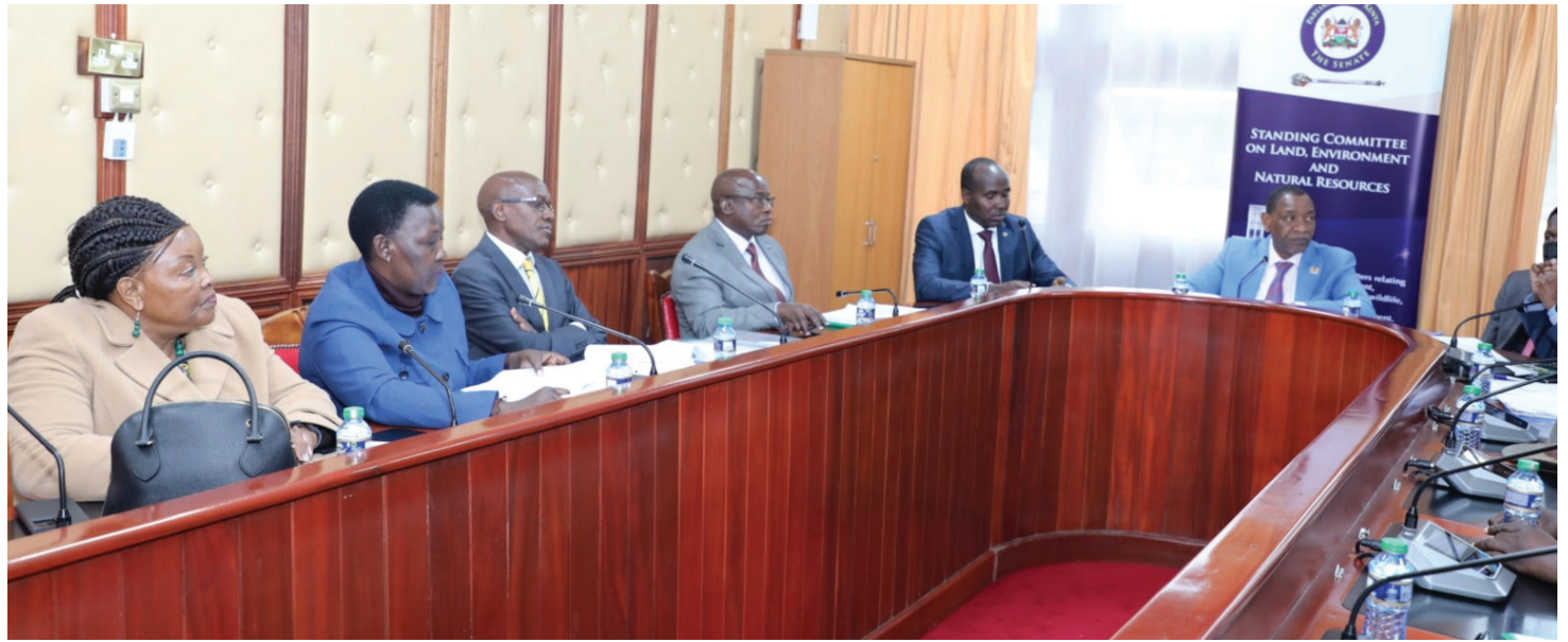
The Senate Committee on Land, Environment and Natural Resources in session last week.

The petitioners claim that due process was followed including public participation, environmental impact assessment and approval by the Cabinet. A Cabinet Memorandum was