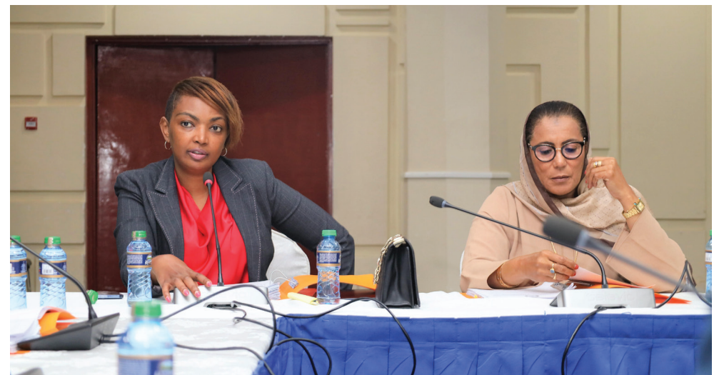
Nominated Senator Karen Nyamu takes the Senate Committee on Information, Communication and Technology through her proposed Digital Literacy Bill, 2023.

The Members of the ICT Committee subsequently deliberated on the contents and the consequences of the proposed legislation on Kenyans and promised to