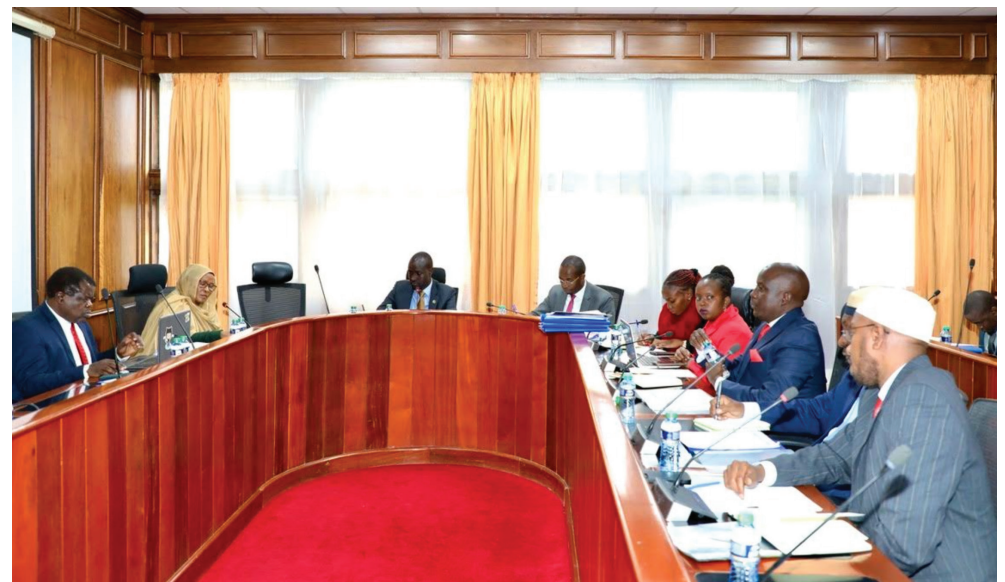
A session of the Senate Committee on Justice, Legal Affairs and Human Rights (JLAHRC) with IEBC leadership last week.

election expenses, the committee dissected the high costs involved in conducting the by-election. Notable expenditures included Kshs 83,462,700 for wages, Kshs 47,585,500 for transportation, Kshs 43,133,300 for meals, Kshs 14,149,082 for printing, and Kshs 10,476,000 for security, in addition to miscellaneous expenses. Altogether, the by-election costs amounted to a whopping Kshs 262,990,772.