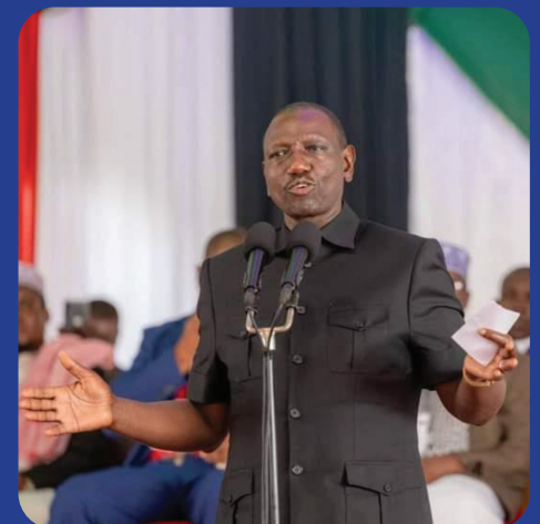
Speaker of the Senate Rt Hon Amason Jeffah Kingi and President William Samoei Ruto during the president's tour of the Coast region last week. The President visited Lamu, Tana River, Kilifi, Mombasa and Kwale counties in his 4-day tour, and launched projects, commissioned new investments and addressed residents on what his government is doing to support devolution and make their lives better.