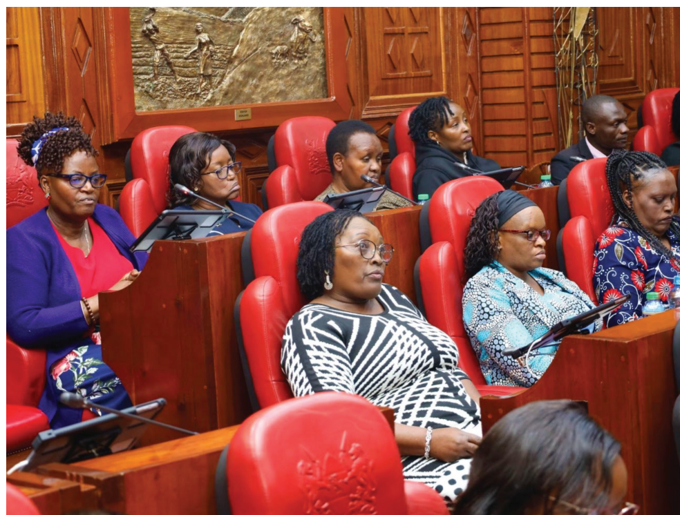
Some of the victims of the '98 bomb blast in Nairobi and relatives when they appeared before the Senate Committee

The Committee acknowledged that the compensation of the victims is long overdue and pledged to ensure they're compensated.