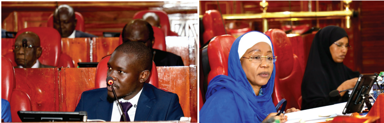
Left; A student leader addresses the Senate Committee on Health which is hearing a petition on the dispute between Kenyatta University and Kenyatta University Teaching, Research and Referral Hospital. Right; Members of the Senate Committee on Health

The Senate Committee on Health last week met with representatives of students, lecturers and leadership of Kenyatta University and management of the Kenyatta University Teaching, Research & Referral Hospital (KUTRRH) following a petition on the use of the hospital by medical students.