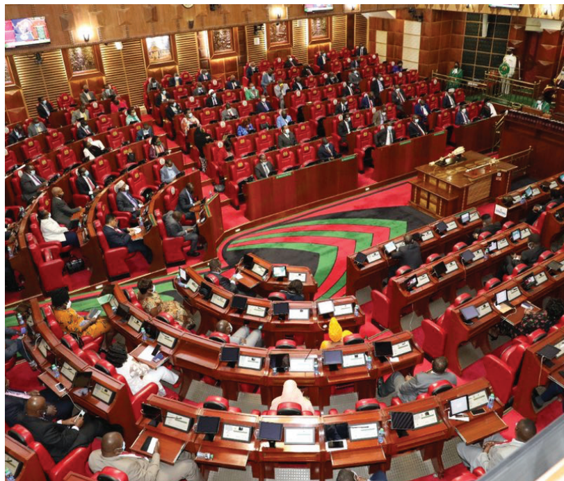
A sitting of the National Assembly at the Main Chamber.