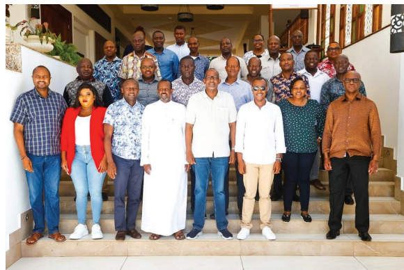
Defence Cabinet Secretary Hon. Aden Duale Principal Secretary for Defence Hon. Patrick Mariru and Vice-Chief of the Kenya Defence Forces Lt. Gen. Francis Ogolla pose for a photo with Members of the National Assembly Committee on Defence, Intelligence and Foreign Relations during a two day retreat in Mombasa.