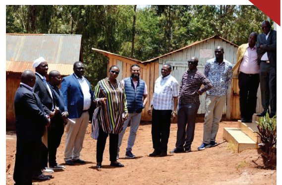
Members of the Hon. Musa Sirma led Select Committee on the National Government Constituency Development Fund on an inspection tour of NG-CDF funded projects