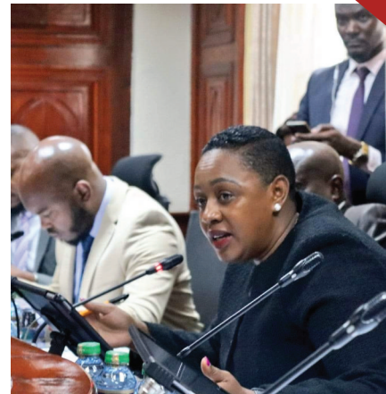
Hon. Sabina Chege during a House Committee on Agriculture and Livestock meeting with the Cereal Millers Association and Grain Mill Owners Association to discuss the maize subsidy programme. The Committee was told Sh7.2 billion was spent on the subsidy programme by the last regime.

Members of the National Assembly led by Deputy Minority leader Hon. Robert Mbui (centre), Ugenya MP Hon. David Ochieng', Dagoretti North MP Hon. Beatrice Elachi, and members of the Senate during the launch of Open Government Partnership Caucus (POGPC) at Parliament Buildings. The POGPC Caucus is envisioned to facilitate strategic positioning of parliamentarians, to enable them to discharge their legislative, oversight, and representation roles more robustly in the governance space.