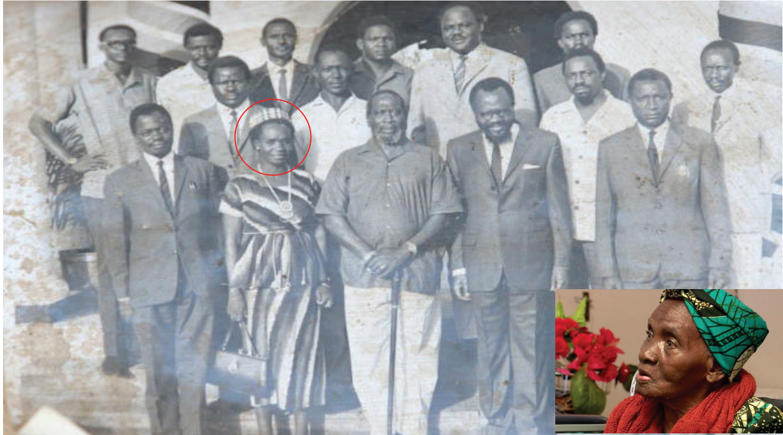
A photo of the late Mama Grace Onyango, former President Jomo Kenyatta and other former Members of Parliament.

M Ps have paid a glowing tribute to Grace Onyango, who made history in 1969