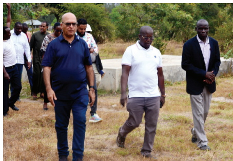
NG-CDF Committee's Vice-chairperson, Hon. Kassim Tandaza (Centre) leads the Committee on inspection tour in Kisumu County.

Members of the committee that was led by Vice-chairperson, Hon. (Eng.) Kassim Tandaza (Matuga) inspected projects started by the fund in Nyakach and Kisumu East Constituencies in Kisumu County.