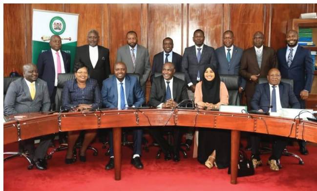
Members of the Public Accounts Committee pose for a photo after a meeting at Parliament Building. The watchdog Committee is chaired by Hon. John Mbadi Deputised by Butere MP Hon. Tindi Mwale.

He noted that their agenda was to ensure prudent financial management adding that they will not protect any government officers found to have misappropriated public funds.