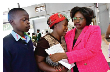
Vihiga Woman Representative Hon. Beatrice Adagala issues a bursary cheque to an emotional mother of a needy student

A parent in Vihiga County was moved to tears after area Woman Representative Hon. Beatrice Adagala took up funding of education of her son through (NGAAF). The parent was unable to control her tears when the County MP gave her a cheque for school fees of her son who had dropped out of school due to lack of fees. During the function, Hon. Adagala gave out bursaries amounting to Sh3.1 million to 15 students who were lucky to be enrolled on a full scholarship and 94 others who received Sh10,000 each as school fees. Hon. Adagala noted that she will continue to support needy students as she urged parents to work hard and ensure their children access education. "My office is providing bursaries to cushion parents from poor backgrounds from the financial burden they have been facing as they struggle to educate their children," she explained. Said Hon. Adagala: "I advocate for education and believe that providing equal opportunities to all students regardless of their financial background is crucial to building a prosperous and equitable society".