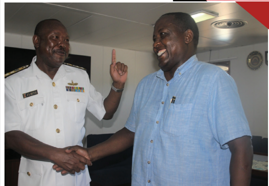
Central Imenti MP Hon. Moses Kirima shares a light moment with a senior Kenya Navy officer during the National Assembly Committee on Defence, Intelligence and Foreign Relations cruise aboard Navy Ship Jasiri.