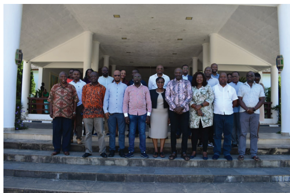
Members of the Parliamentary Committee on Education pose for a picture after a meeting with stakeholders in the sector in Mombasa last week.

The Education Committee chair made the remarks in a speech read on his behalf by Marakwet West MP Timothy Kipchumba, during a consultative departmental meeting