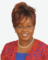
Kibwezi East MP Jessica Mbalu

Kibwezi East MP Jessica Mbalu asked the CS for Energy wanting the ministry to provide details of the number of public utilities, including primary and secondary schools in Kibwezi East Constituency that are not connected to electricity. She also asked to be provided a status report on electrification projects for other areas in Kibwezi East Constituency that are not connected to electricity and plans being undertaken to ensure that the areas get connected to the national grid.