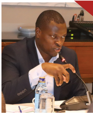
National Assembly Committee on Budget and Appropriations Chairperson Hon. Ndindi Nyoro during a sitting on the 2023 Budget Policy Statement.