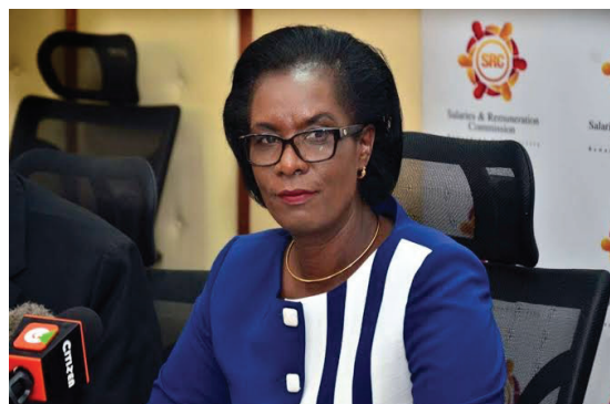
Salaries and Remuneration Commission Chairperson Lyn Mengich addresses a past press conference in Nairobi.