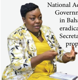
Bahati MP Hon Irene Njoki

Bahati MP Hon Irene Njoki asked the CS for Interior and National Administration an explanation on the steps that the Government has taken to fight proliferation of illicit brews in Bahati Constituency including steps being taken to eradicate their production and sale. "Could the Cabinet Secretary explain mechanisms put in place to enforce proper disposal of illicit brews nabbed by Police during swoops to ensure that the product does not find its way into circulation," Njoki asked.