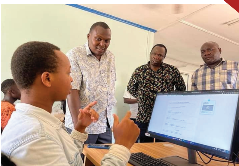
Members of the National Assembly Committee on Communication Information and Innovation led by Kuresoi Central MP Hon. Joseph Tanui (centre) during an inspection tour of constituency innovation hubs in Coast and Nyanza region.