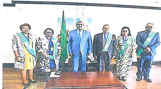
Courtesy call on the PAP President