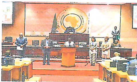
Swearing in of the Members of the Delegation